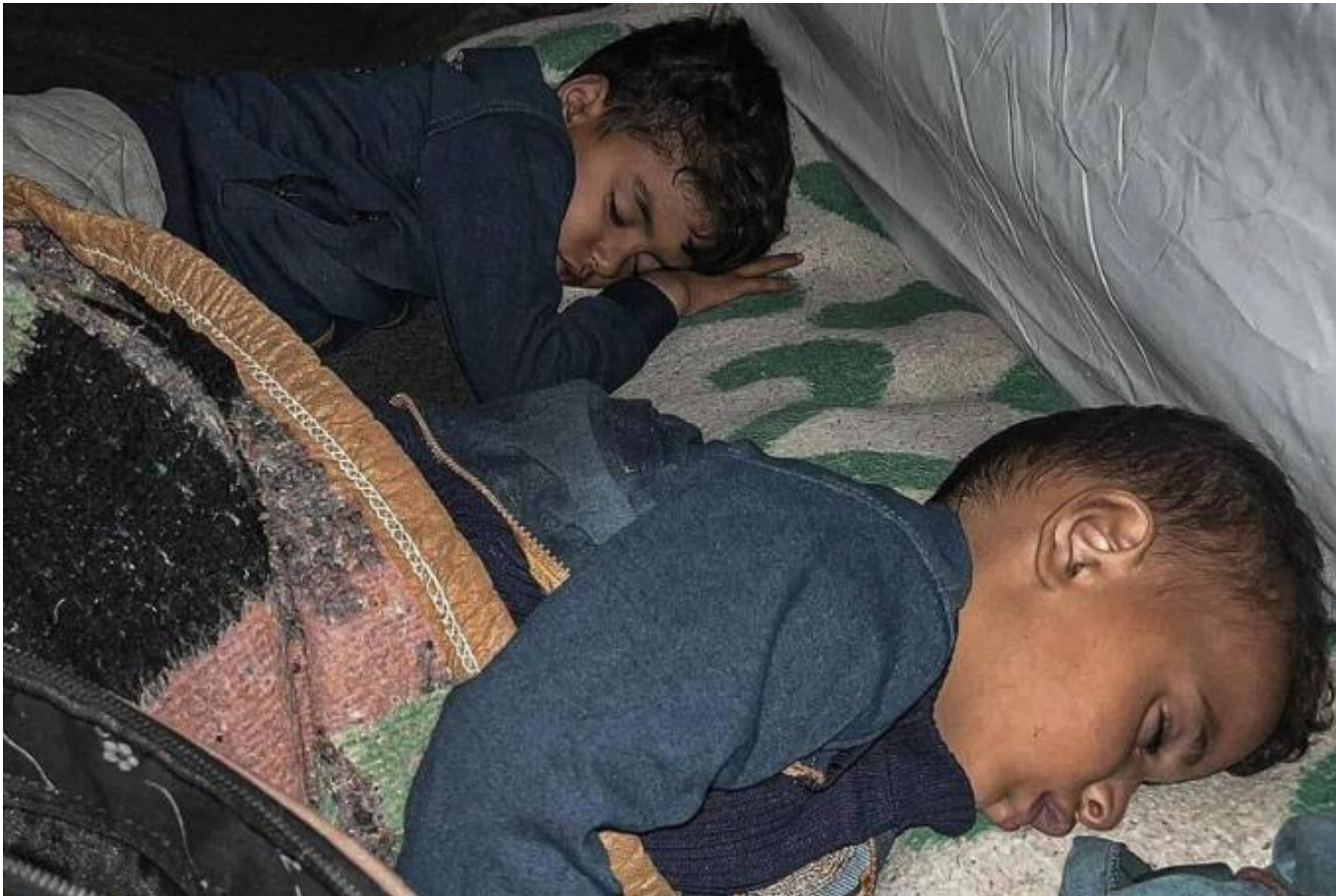
Palestinian children sleep in a tent in the cold, rainy weather.