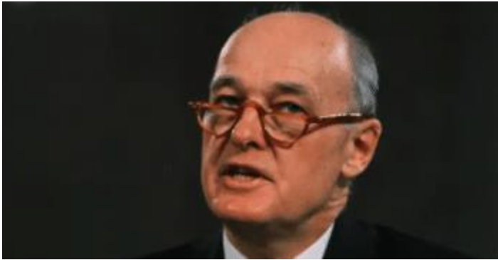
George F. Kennan

The overriding imperative of the weapons industry, however, was to revitalize cold war thinking to ensure continuously high military budgets and the expansion of NATO and the think-tanks were enlisted to fulfill that end.